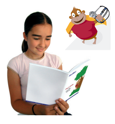
The Mirage Kidsta Nasal Mask comes with a child's instruction booklet introduced by the mask mascot Oko. The guide includes a diary to help chart progress and is valuable when it comes to acclimatization and compliance.