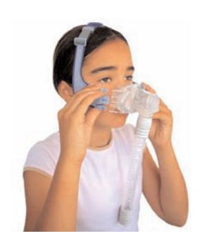
Child-friendly design allows smaller hands to grasp parts easily.